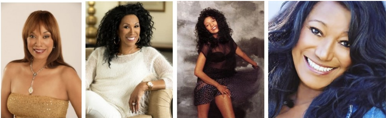
The original Pointer Sisters – left to right, Anita, Ruth, June, Bonnie

On 31st December 2022, it was announced that Anita Pointer of the Pointer Sisters passed away at her Beverley Hills home after battling cancer, aged 74. The Grammy Award winning sisters first formed when Bonnie and June Pointer began performing together in 1969. Elder sister Anita joined a year later, and the trio were signed by Atlantic Records, releasing a number of unsuccessful singles. In December 1974, eldest sister Ruth joined, and the Pointer Sisters became a quartet. Moving to Blue Thumb records, they began to achieve some success before Bonnie left the group in 1978 to become a solo artist. Despite Bonnie's departure, the revised line-up of June, Ruth and Anita went on to achieve fame and commercial success, scoring hits with "Automatic" and "Jump (For My Love)". More hits followed, including "Fire" (1979), "He's So Shy" (1980), "Slow Hand" (1981), the remixed version of "I'm So Excited" (1984), and "Neutron Dance" (1985).