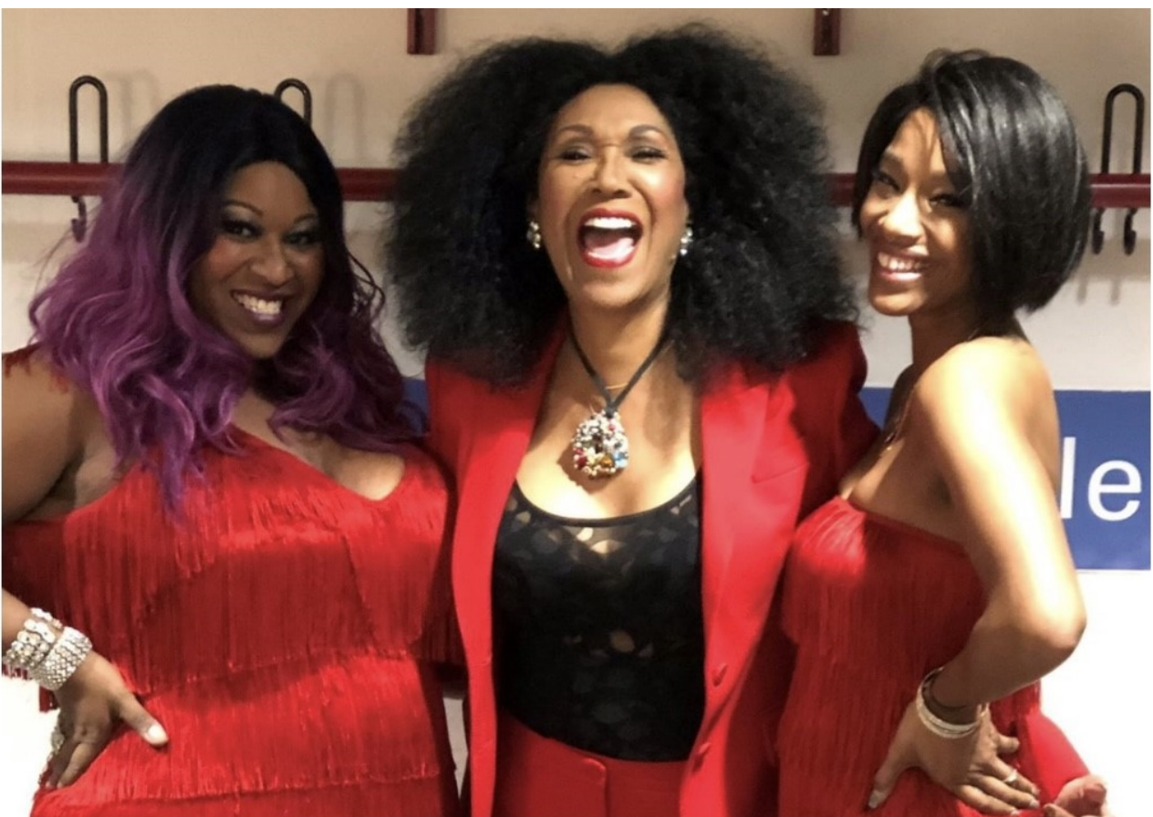
Pointer Sisters in 2023, left to right, Issa, Ruth and Sadako

Someday We'll Be Together followed in 1981, and featured on the album Black and White , again produced by Richard Perry. It was selected for release as a single in the UK and Canada.