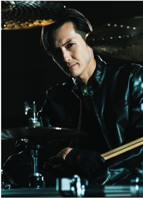
Yosuke Ibuki (photo credit www.yosukeibuki.com )

https://www.youtube.com/watch?v=wpKAB6nxvol