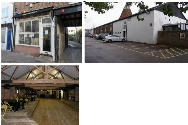
Left to right: Wrights Fish and Chips on East Street, Southern Maltings exterior and interior on Kibes Lane.

After debating whether to travel by car, I opted to let the train take the strain. Fortunately, the date didn't clash with any of the train drivers' strikes, and all the connections worked out perfectly. Five minutes after leaving the train I checked in at the nearby Premier Inn, an hour earlier than expected, and set off to explore some of the delights of Mr Ballard's hometown. As on a previous RBE trip, I ventured to Wrights, an old-fashioned British Fish and Chip shop situated on East Street, for a traditional English takeaway.