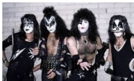
Left and middle: New York Groove by Ace Frehley, right: Kiss in costume as l to r, Spaceman (Ace Frehley), The Demon (Gene Simmons), The Starchild (Paul Stanley) and the Catman (Peter Criss)