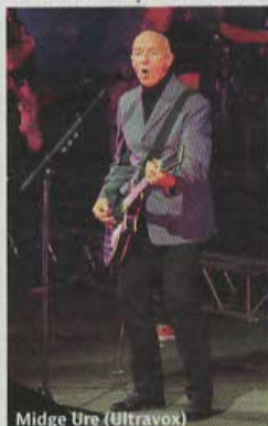
Midge Ure (Ultravox)