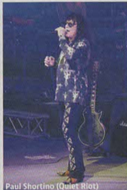
Paul Shortino (Quiet Riot)