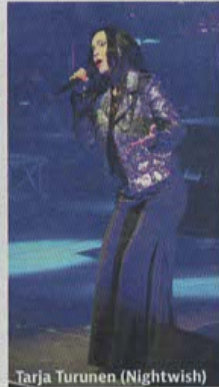
Tarja Turunen (Nightwish)